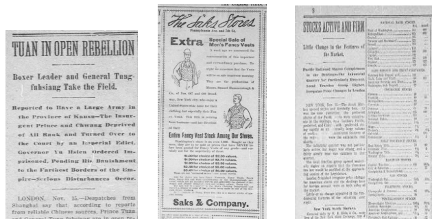
Fig. 6. : Three examples of newspaper structures that can facilitate automated processing. In the article on left, note the distinctive layout and fonts. In the advertisement, center, note the dark border. For the stock reports on the right, note the distinctive tabular structure.

This consistent way of formatting news articles is helpful in discriminating articles that are not news. There are many medical cures advertised that try to pass for news articles but lack the formatting particular to news articles.. Also, as the Washington Times fills the entire column, many very small articles are included in its pages. Typically, these are a one-to-three sentence excerpts from other newspapers; these excerpts are consistently formatted as well.